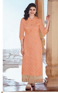
| 38407 |