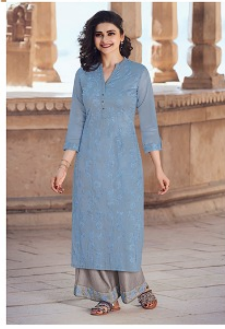
| 38401 |