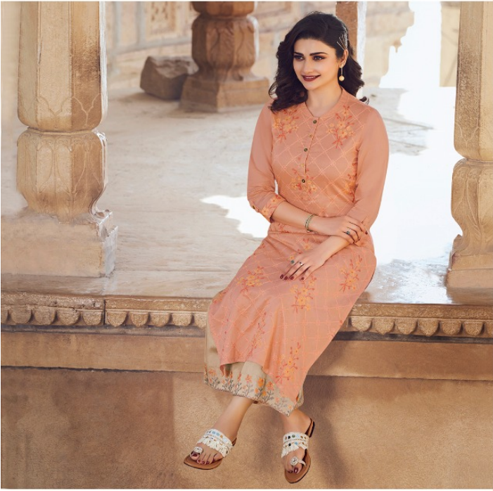
| 38407 |