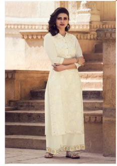
| 38406 |