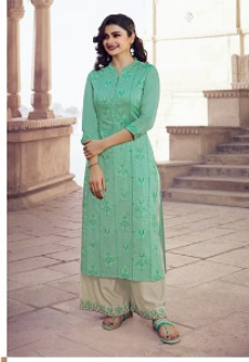
| 38403 |