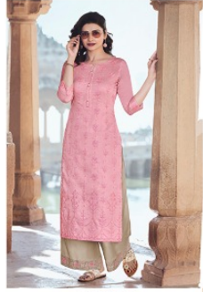
| 38404 |