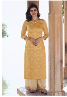
| 38402 |