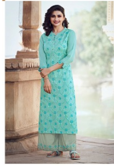
| 38405 |