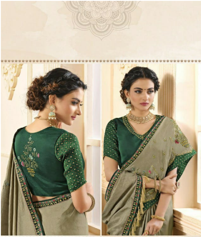
It round up at the bottom thread the saree you the short ways to wear Green Saree.