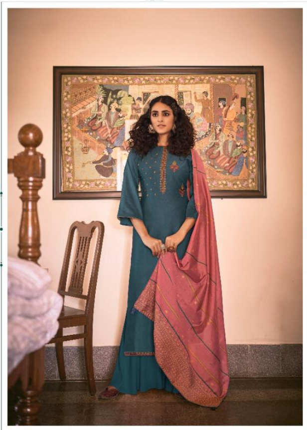
◆ DN. 1004 ◆