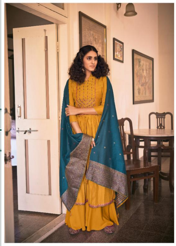
◆ DN. 1001 ◆