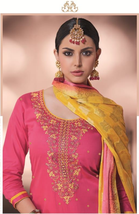
The essence of beauty and elegance wrapped altogether.