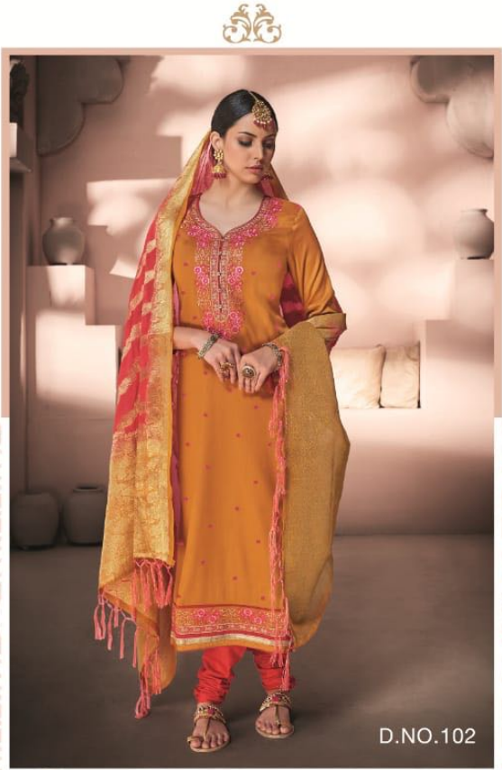
The essence of beauty and elegance wrapped altogether.