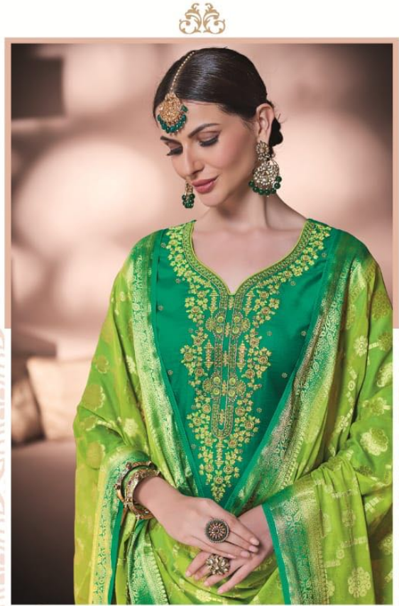
The essence of beauty and elegance wrapped altogether.