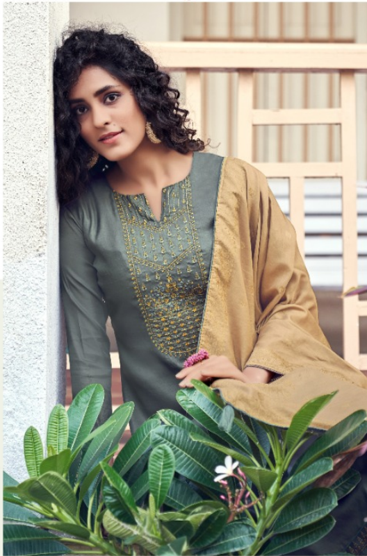
Behind a breath of morning air with the fragrance of rain. All it takes is the beat of a heart that you call that will be true. We hold a lot of heart - traditions are forever with us Embracing with its grace and grandeur. Modern a love grows here off in The inspiration of traditional style.