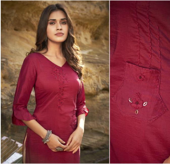
Fashionable Style is a reflection of your attitude and your personality. Style Be style icon in any occasion by wearing this beautiful Kurtis D.NO. 1004