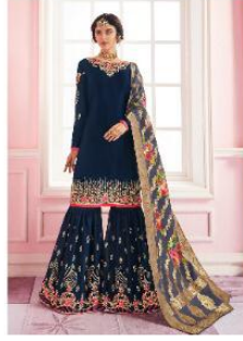
* 8005 *