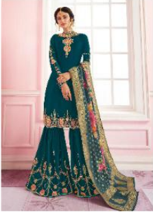
* 8001 *