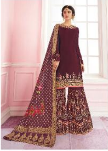
* 8003 *