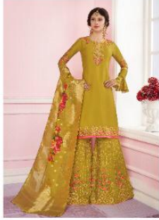
* 8004 *