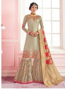
* 8002 *