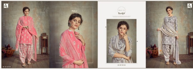
◆ I-627-001 ◆