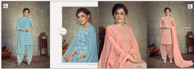
◆ I-627-003 ◆