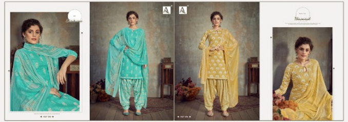
◆ I-627-005 ◆