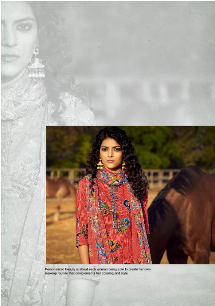
Personalized beauty is about each woman being able to create her own makeup routine that complements her coloring and style