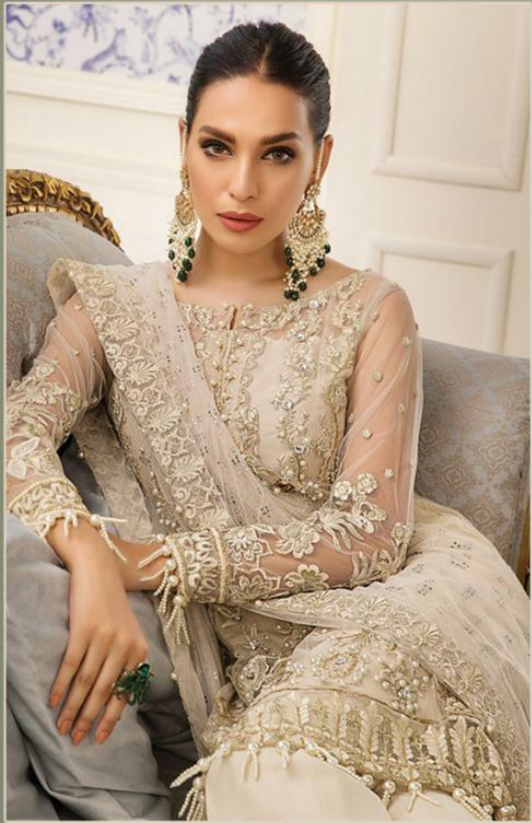
TOP:- BUTTERFLY NET WITH HEAVY EMBROIDERY & DIAMOND WORK BOTTOM + INNER:- DUL SHANTUN DUPATTA:- BUTTERFLY NET WITH HEAVY EMBROIDERY WORK