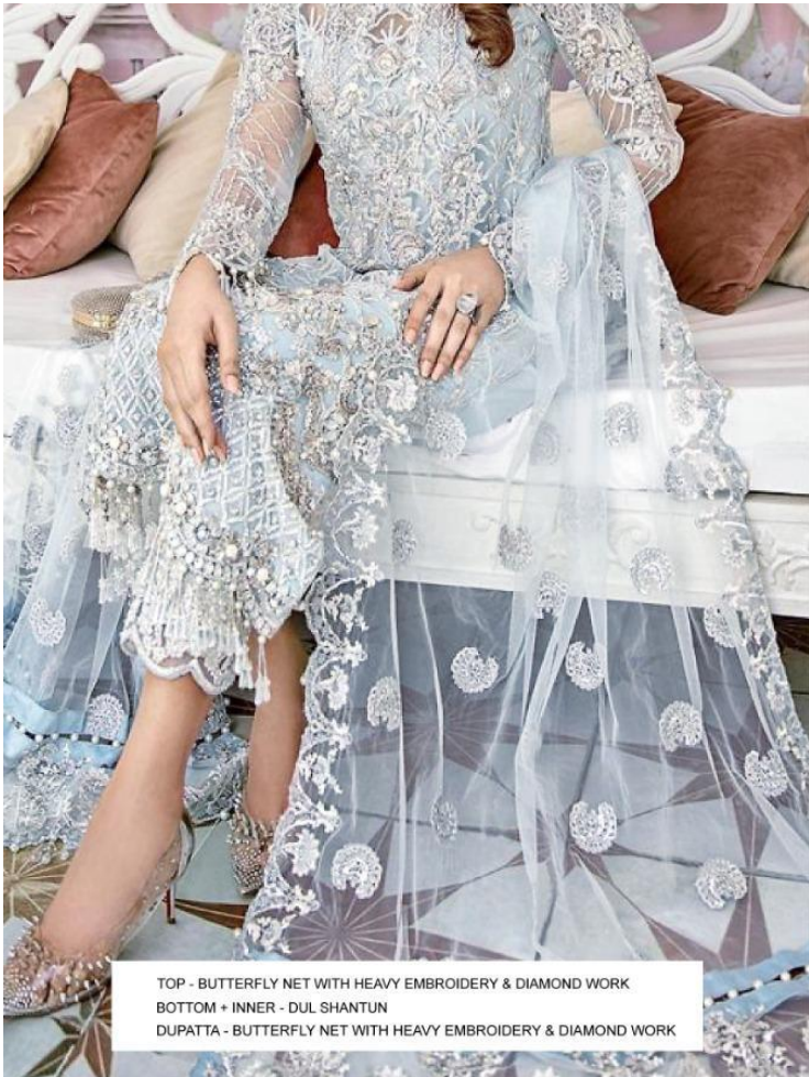
TOP - BUTTERFLY NET WITH HEAVY EMBROIDERY & DIAMOND WORK BOTTOM + INNER - DUL SHANTUN DUPATTA - BUTTERFLY NET WITH HEAVY EMBROIDERY & DIAMOND WORK