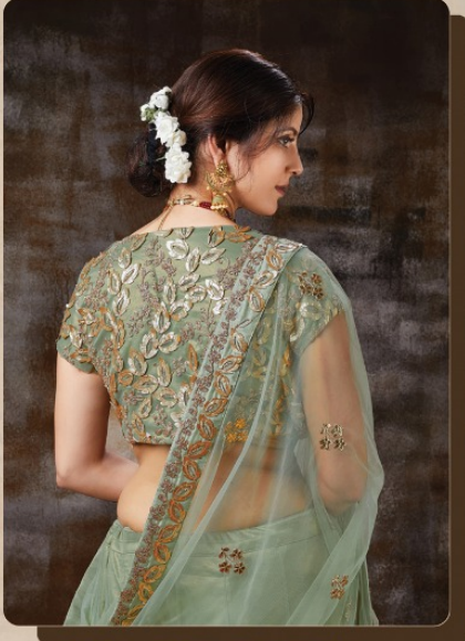
FABRIC : SATIN SILK, NET