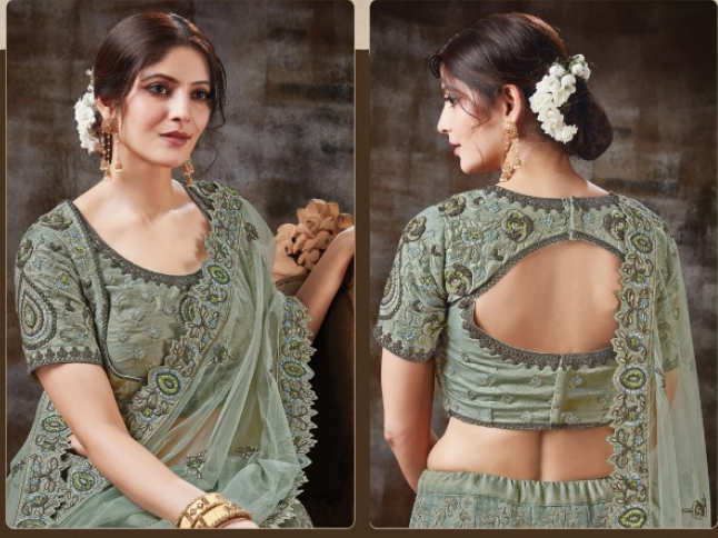
FABRIC : SILK