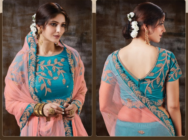
FABRIC : SILK