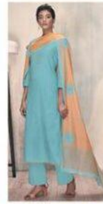
D.NO :- C0204