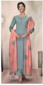
D.NO :- C0197