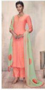
D.NO :- C0200