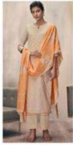
D.NO :- C0201