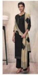
D.NO :- C0203