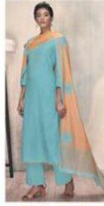
D.NO :- C0204