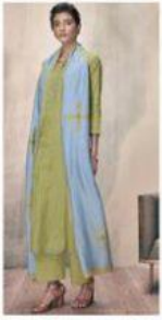
D.NO :- C0196