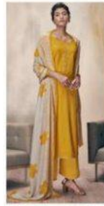
D.NO :- C0202