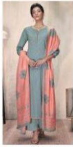
D.NO :- C0197