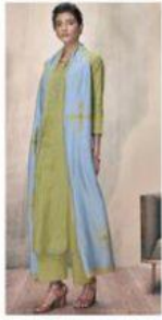
D.NO :- C0196