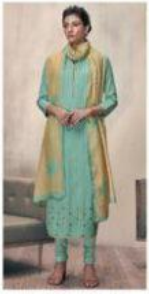
D.NO :- C0199