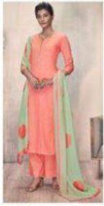
D.NO :- C0200