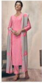
D.NO :- C0198