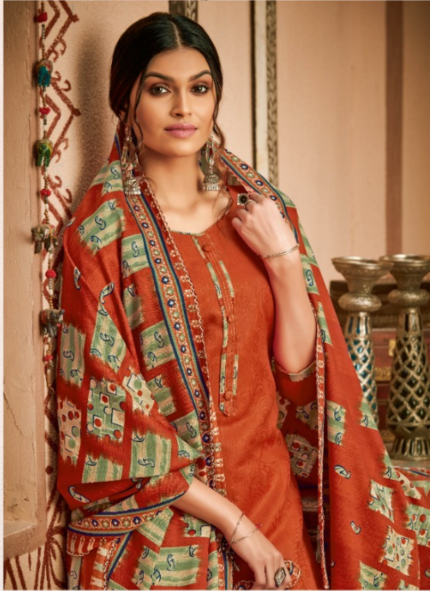
THE LOOKING CLASSY celebrating of that best of indian fashion