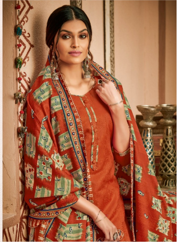
THE LOOKING CLASSY celebrating of that best of indian fashion