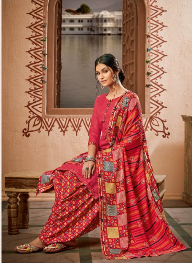
ORNATE WITH FLOBAL PATTERN trends and style keep changing and we constantly uplating our