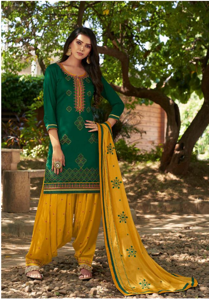
BEAUTIFUL SHADES 5632

Love fabrics, bold patterns & simplicity crafting modern ethnic silhouettes.