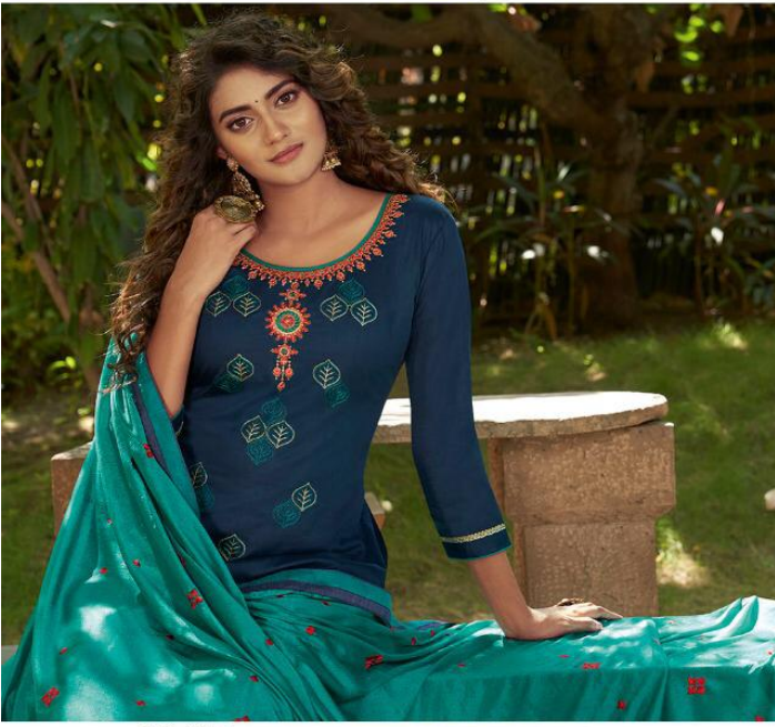
ROYAL ELEGANCE 5634

Embrace one of the purest trends this season