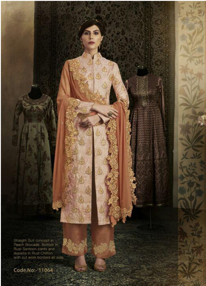
Straight Suit concept in Peach Brocade. Bottom in Rust Santoon pants and dupatta in Rust Chiffon with cut work borders all side.