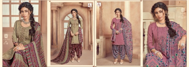
I 682 009