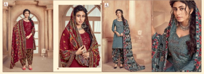
I 682 007