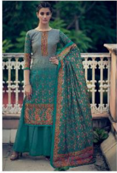
CODE / 2003