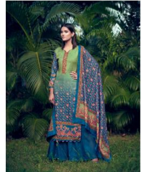
CODE / 2004