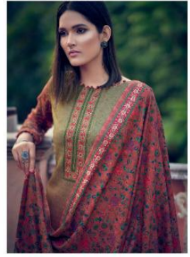
CODE / 2002