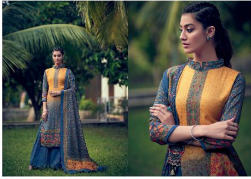
CODE / 2001