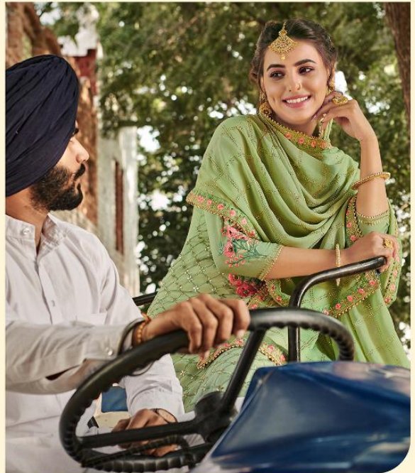
The Punjabi girl is the perfect amalgamation of delicate femininity and powerful energy.