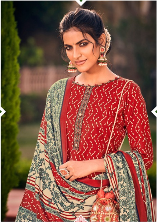
PURE ELEGANCE WITH ALLURING RICHAN PATTERNS ON SOFT FABRIC AND SOFT SILKNESS TO YOUR STYLE. 465-003