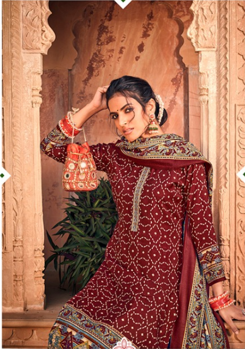
PURE ELEGANCE WITH ALLURING FLORAL PATTERNS ON LACY FABRIC ADD GLAMOUR TO YOUR STYLE.