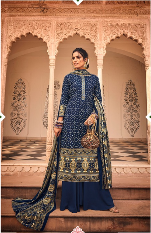
PURE ELEGANCE WITH ALLURING BORDAR PATTERNS ON SILK FABRIC AND SHAWL BLANKET TO YOUR STYLE. 465-009