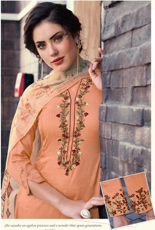
She exudes an ageless presence and a wonder that spans generations.