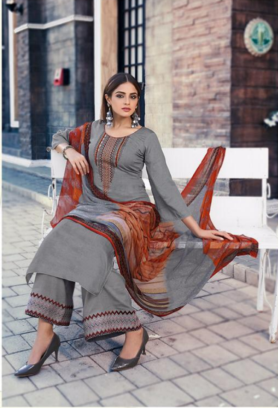
Her charm only grows with the passing of the ages, much like time.