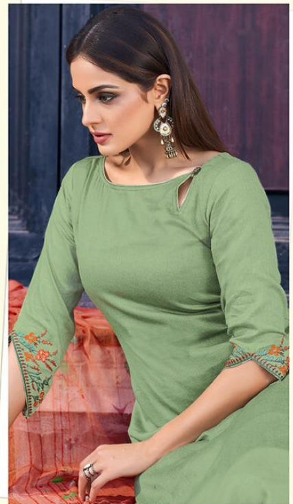
The world of Beautiful Bridals...

Make an unforgettable impression with your inimitable style statement.