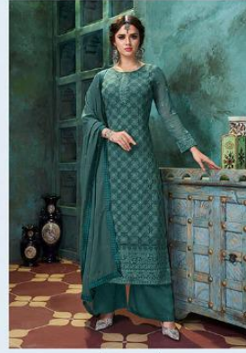
| 2001 |