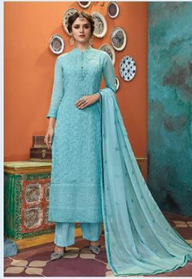
| 2001 |