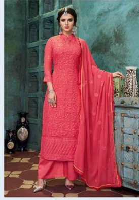
| 2001 |