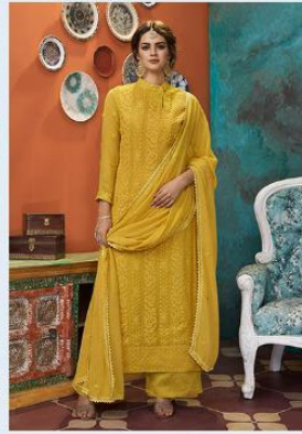
| 2001 |