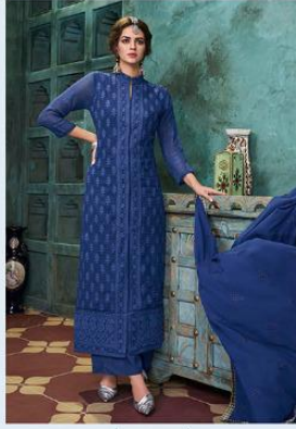
| 2001 |