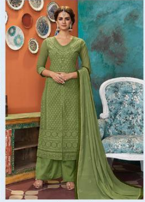
| 2001 |