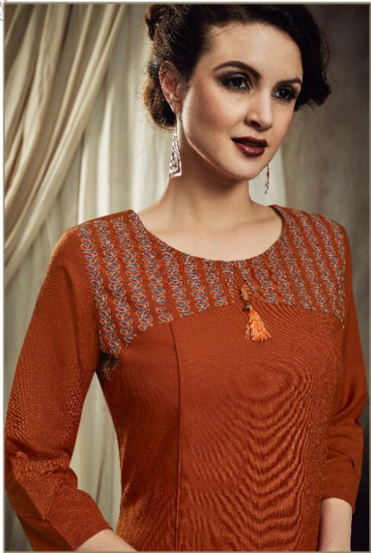
Everything you need to refresh your festive wardrobe from dateless drapes to the color craze of the season.