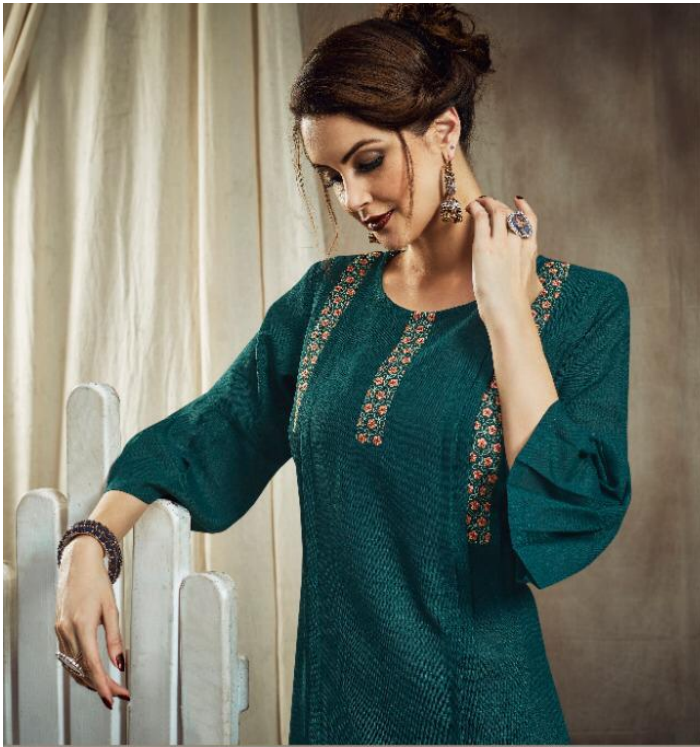
A breath taking array of fine detailing & intricate design inspired by Indian culture. 2001