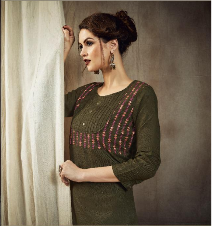
A scintillating plethora of timeless masterpieces inspired by beauty from Indian culture. 2001