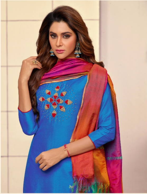
3010 Clothes mean nothing until someone lives in them