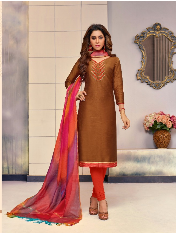
3012 Fashion is the armour to survive the reality of everyday life