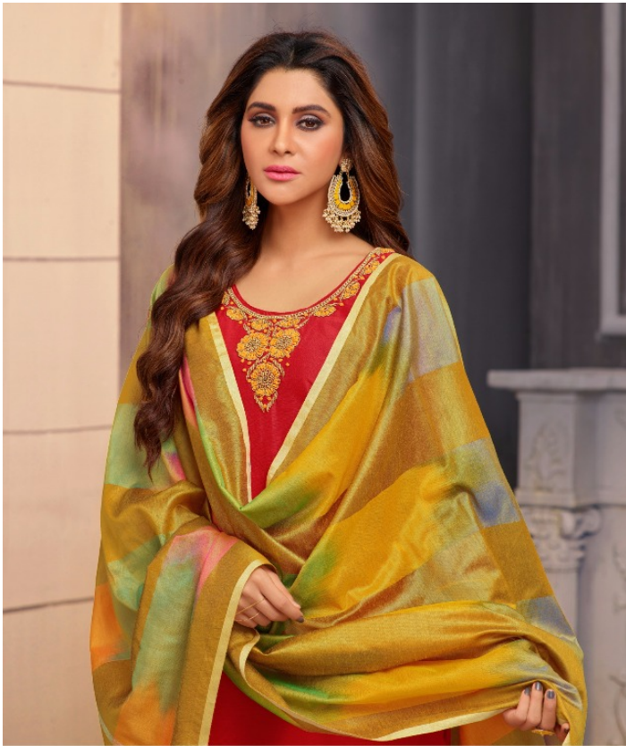
3003 Style is a way to say who you are without having