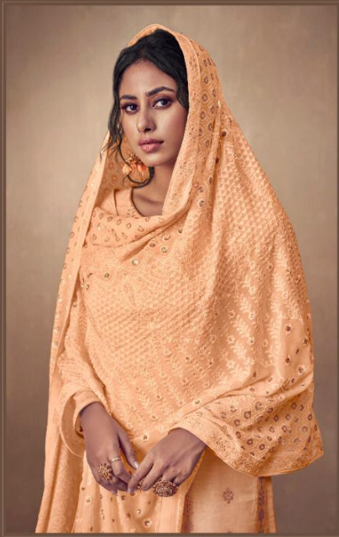
669 / PRETTY CUTS & DESIGNS