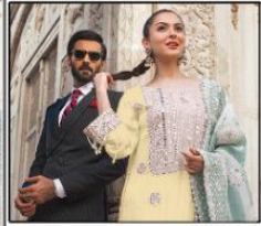
D.NO. C 3111 C