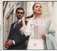
D.NO. C 3111 B