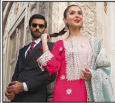
D.NO. C 3111 D