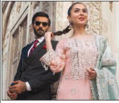
D.NO. C 3111 A