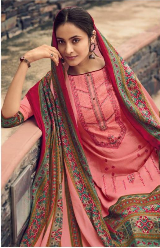
D.NO.14705 ● ● ● ● ●