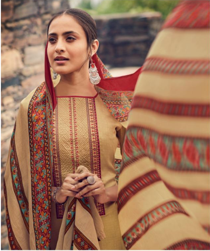
D.NO.14708 ● ● ● ● ●