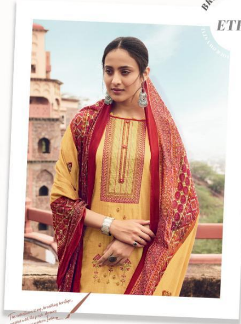
The collection is an beautiful heritage related with the past, history and roots of western culture.