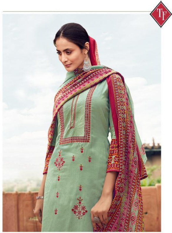
D.NO.14706 ● ● ● ●