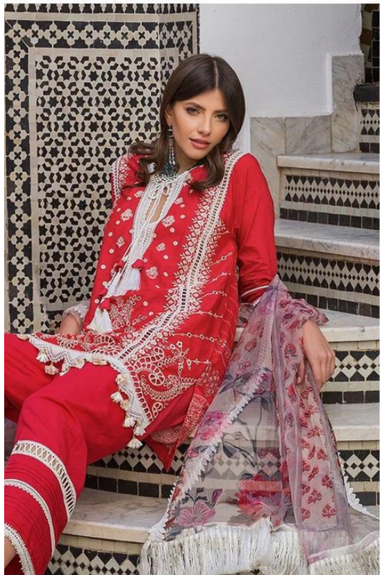
from the masterpieces, creativity and perfection bring new charm in you