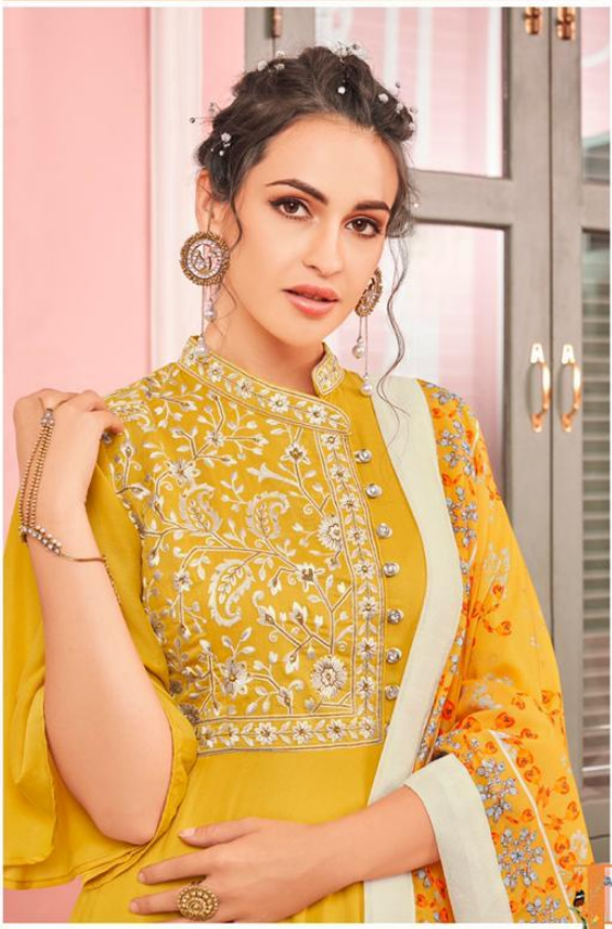
The contemporary design for the fashion conscious women who prize the traditional art and culture of India