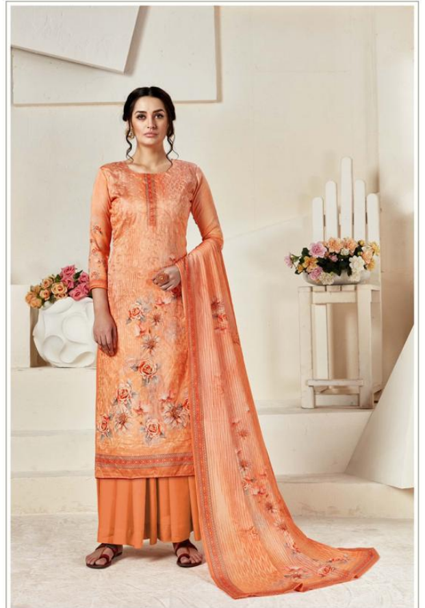
Bright colour is one of the strongest fashion statement of the season and bold designs give fashion a more ethereal and exotic effect. 42007