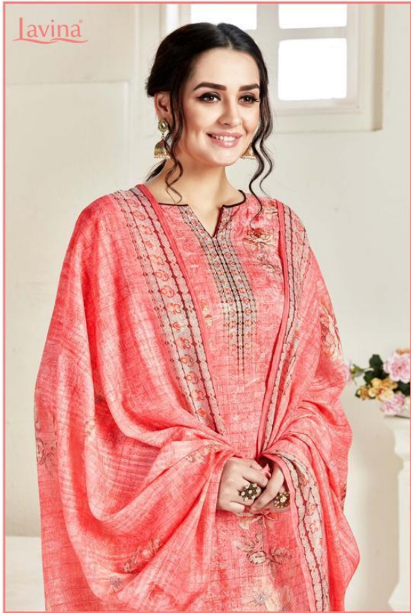
Bright colour is one of the strongest fashion statement of the season and bold designs give fashion a more ethereal and exotic effect.