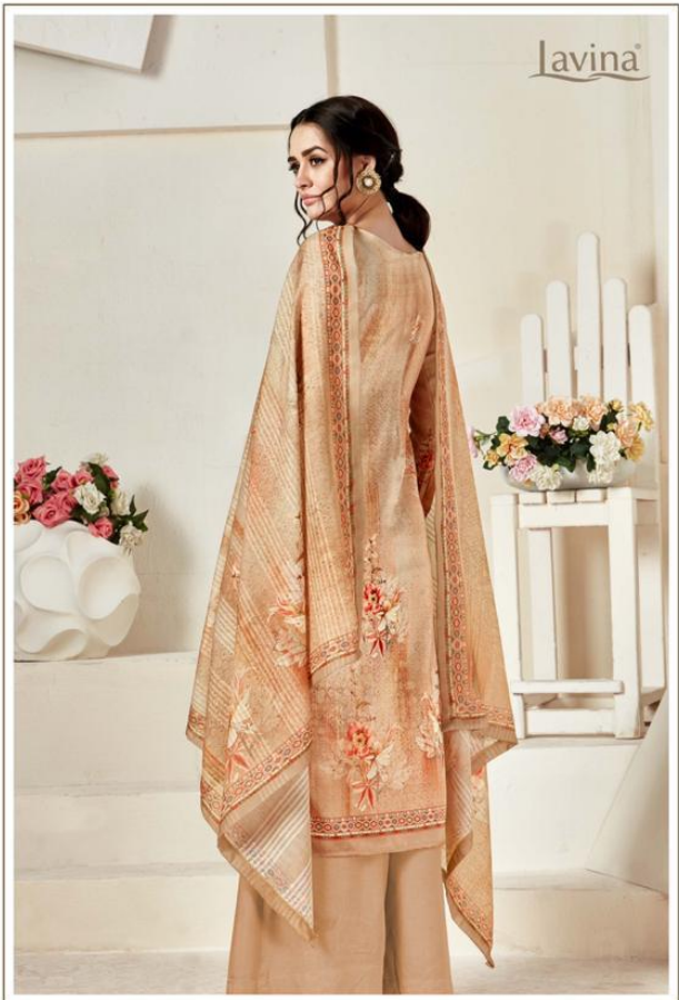
Bright colour is one of the strongest fashion statement of the season and bold designs give fashion a more ethereal and exotic effect. 42003