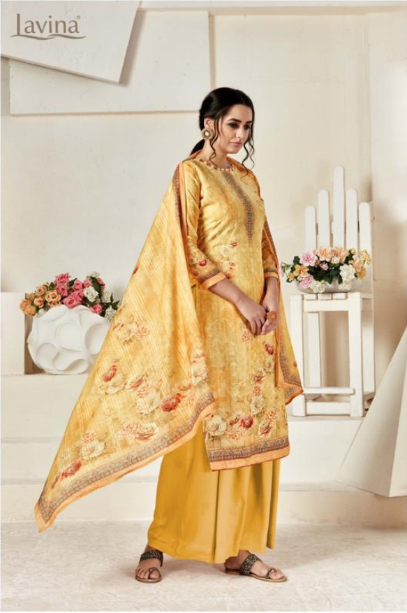
Bright colour is one of the strongest fashion statement of the season and bold designs give fashion a more ethereal and exotic effect. 42005