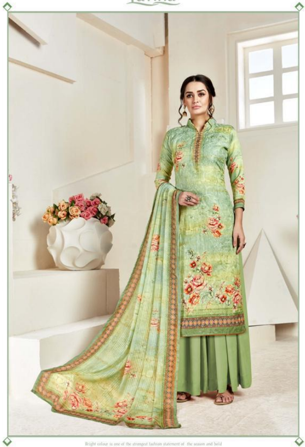
Bright colour is one of the strongest fashion statement of the season and bold designs give fashion a more ethereal and exotic effect.