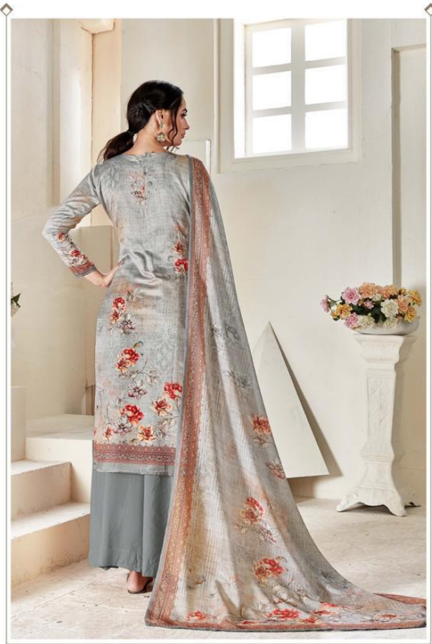
Bright colour is one of the strongest fashion statement of the season and bold designs give fashion a more ethereal and exotic effect. 43001