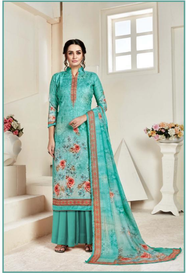
Bright colour is one of the strongest fashion statement of the season and bold designs give fashion a more ethereal and exotic effect.