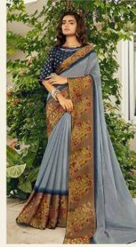
*** D.NO-5539 ***