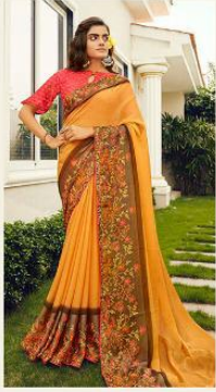
*** D.NO-5538 ***