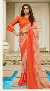
*** D.NO-5535 ***