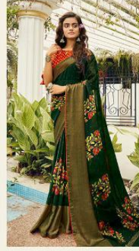
*** D.NO-5534 ***