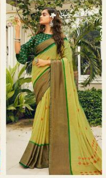
*** D.NO-5536 ***