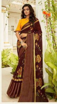
*** D.NO-5533 ***