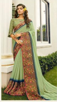
*** D.NO-5532 ***