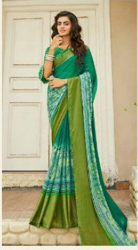
*** D.NO-5531 ***