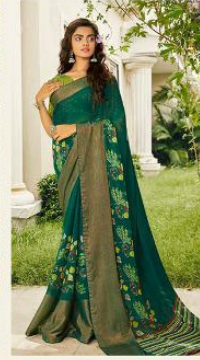
*** D.NO-5540 ***