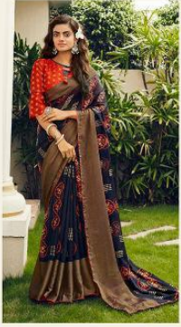
*** D.NO-5537 ***