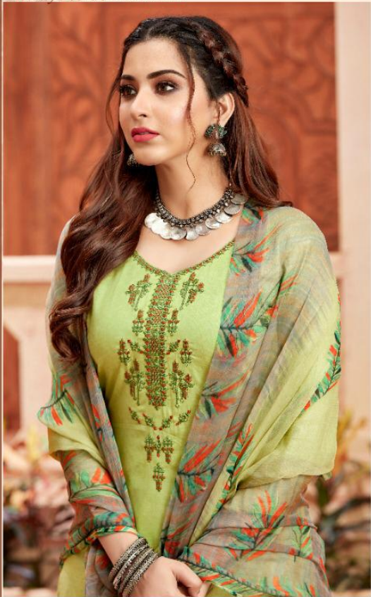
A woman's dress should be a like a barbed-wire fence: serving its purpose without obstructing the view