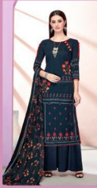
S - 208