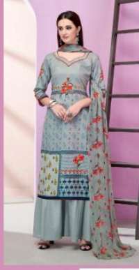
S - 203