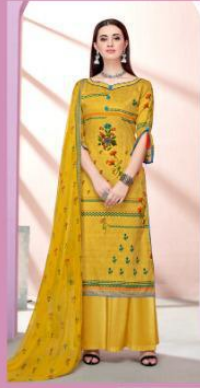
S - 209