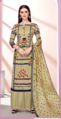
S - 201