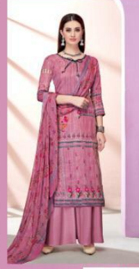
S - 205