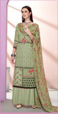
S - 206