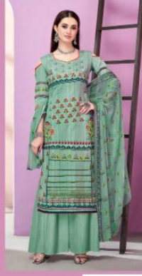
S - 204