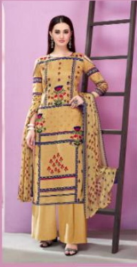
S - 207