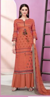
S - 202