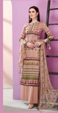
S - 210