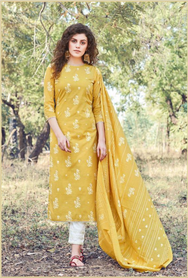
PROJEKTORE DI BANGKOK, THAILAND, 2019. FOTOGRAFIA DI UNA DONNA IN UN GIARDINO DI STILE TRADIZIONALE THAI. RICAMBIATO DA MODERNIZATION, CIVILE 19.