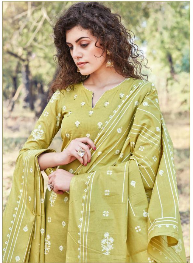
WE PROMISE TO BRING YOU THE BEST OF INDIA'S FINEST FABRICS BUT IT'S THE TRADITIONAL KNOWLEDGE OF ACCOMMODATION ALONG WITH THE POWER TO MAKE UNUSUAL YET GRACEFUL 180-008