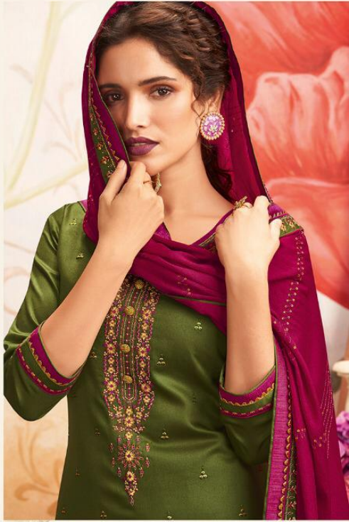
TRADITIONAL GLAMOUR 113