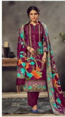
« D.No. 4916 »