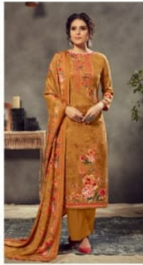
« D.No. 4917 »