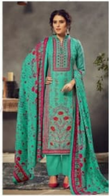
« D.No. 4913 »