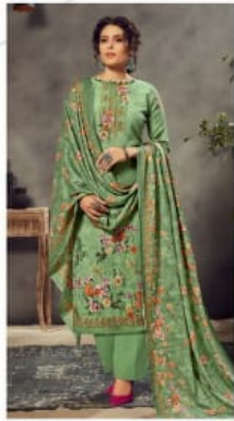
« D.No. 4921 »