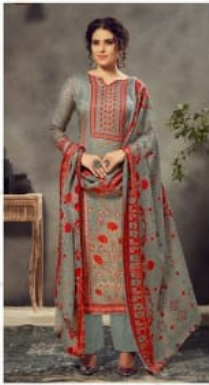
« D.No. 4920 »