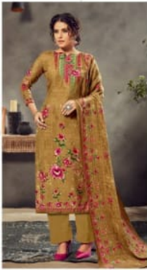
« D.No. 4915 »