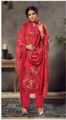
« D.No. 4919 »