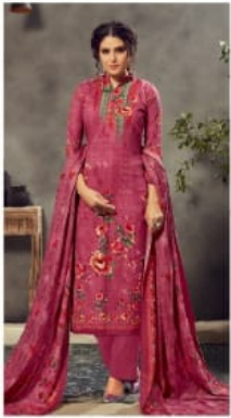
« D.No. 4914 »