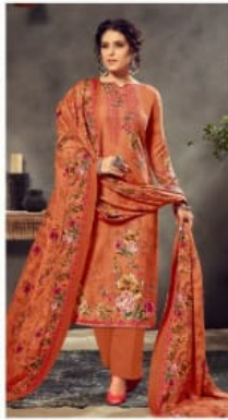
« D.No. 4922 »