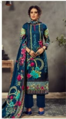
« D.No. 4918 »