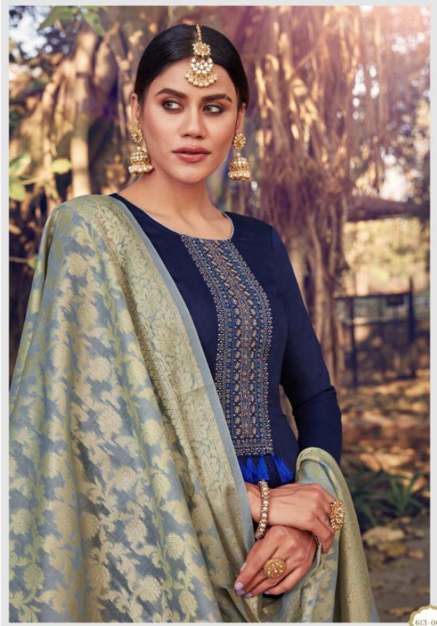
● THE STYLISH ELEMENTS IN BIKANER FASHION BEING TRANSFORMED INTO A CUSTOMIZED ELEGANT PIECE OF FINE AND URBAN REGIONAL CLOTHING.