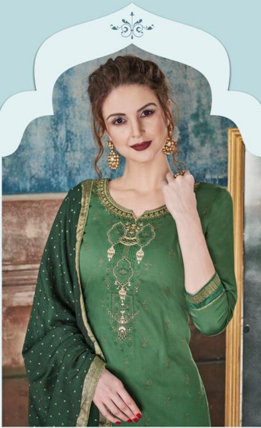
Cast a regal spell of tradition. D.NO.5475