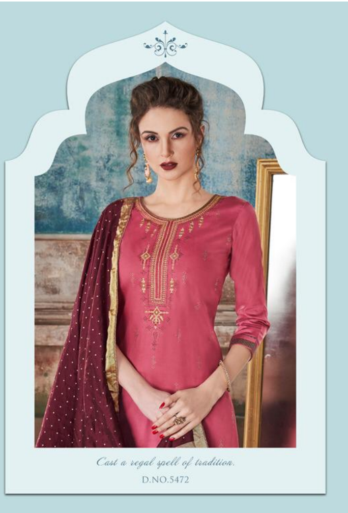
Cast a regal spell of tradition. D.NO.5472