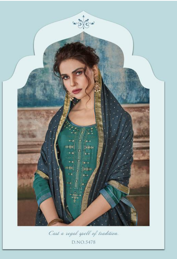
Cast a regal spell of tradition. D.NO.5478