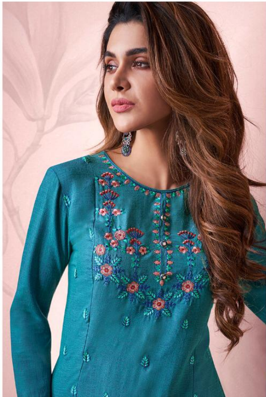
Assemble with the elegance of design & tradition with a twist of modernity. 2015