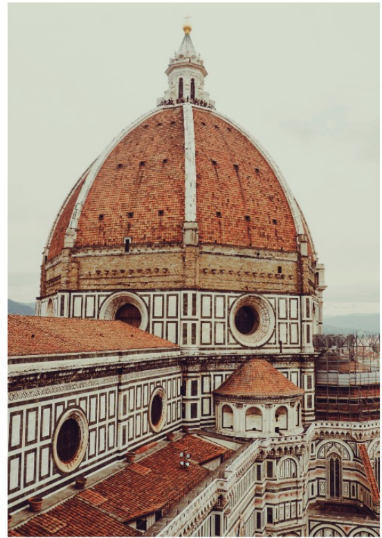
SOBIA NAZIR SPECIAL COLOUR EDITION VOL 4