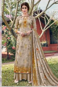
Code # 13806