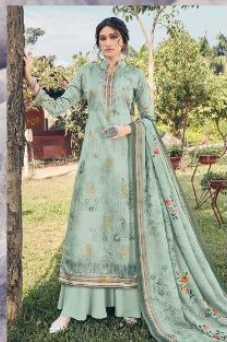
Code # 13807