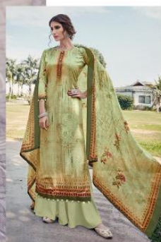
Code # 13808