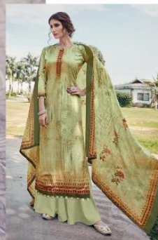
Code # 13808