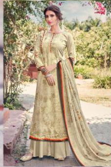
Code # 13803