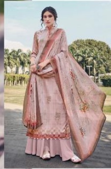
Code # 13804