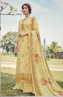
Code # 13805