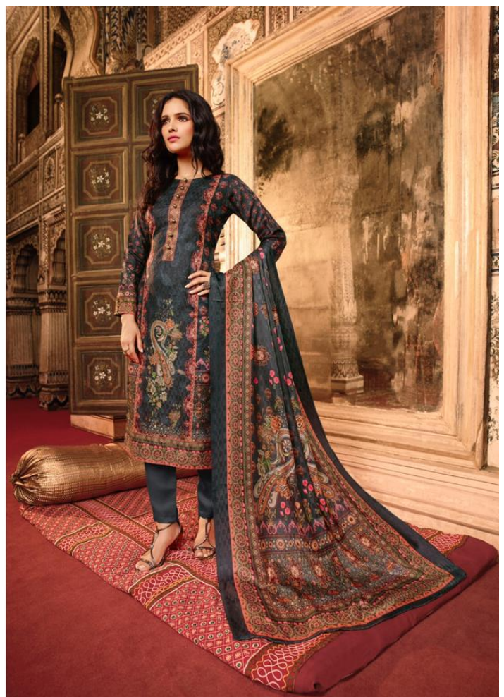
Beautifying "reigning my love for the timeless classic..." 3005