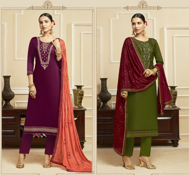
■ D.NO. 1311 ■