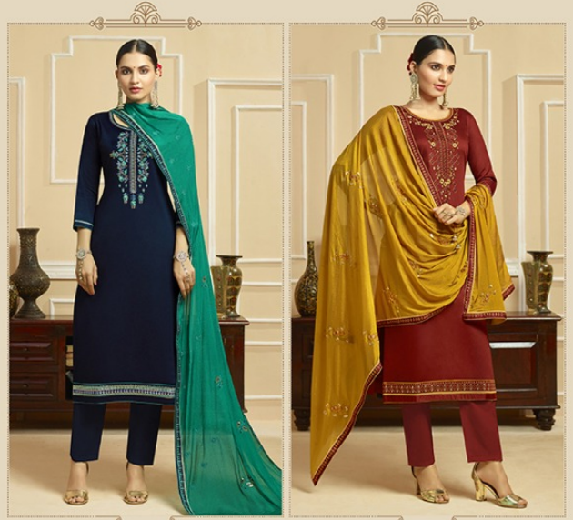
■ D.NO. 1313 ■