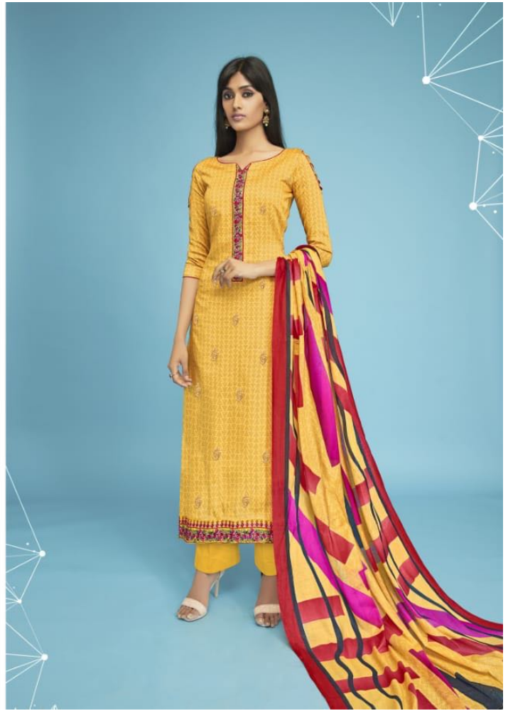
DESIGNS - 5502

Intention is often the ability to reach into the past and bring back what is good, which is beautiful, which is useful, which is being