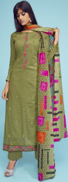
DESIGNS - 5501

Trendy, young and vivacious, fabric to cater the women who refuse to let their hearts age.