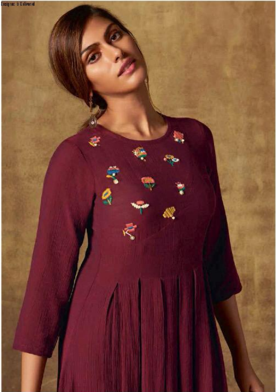
Two sleeve long-sleeved dress with floral embroidery. The dress is made of cotton and comes with a pleated skirt. The dress is available in two colors: Claret and Silver. The dress is available in sizes: S, M, L, XL, XXL, XXXL.