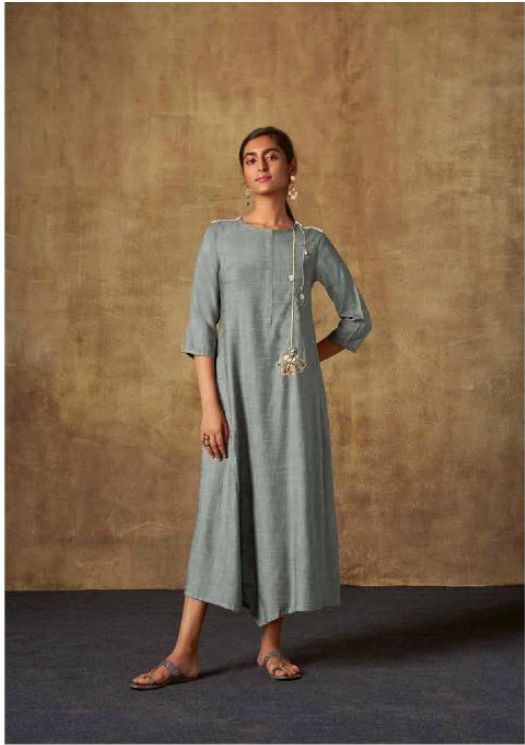
Our casual button with free-flowing shapes that allow for ease of movement with touch of ocean and chain part of their styling. The fabric is a 3-way stretch and designed especially for women's business with 40%TCR308