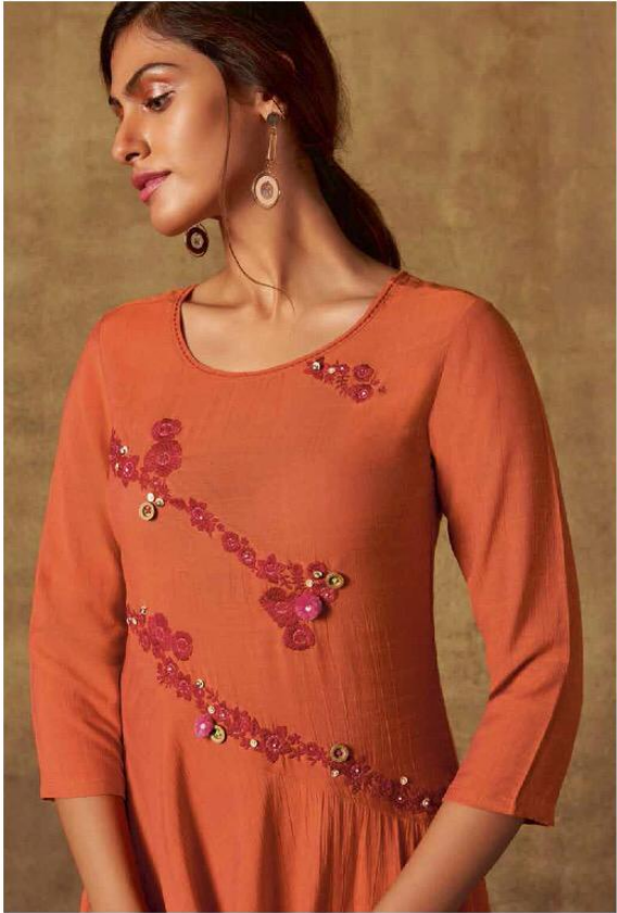
OTS 132802 132802 132802 The flowing silhouette has a low neckline and is accented with gold and pink floral and sequin border detailing. The tunic is made of cotton and is perfect for casual wear to parties and "BRUNCH".