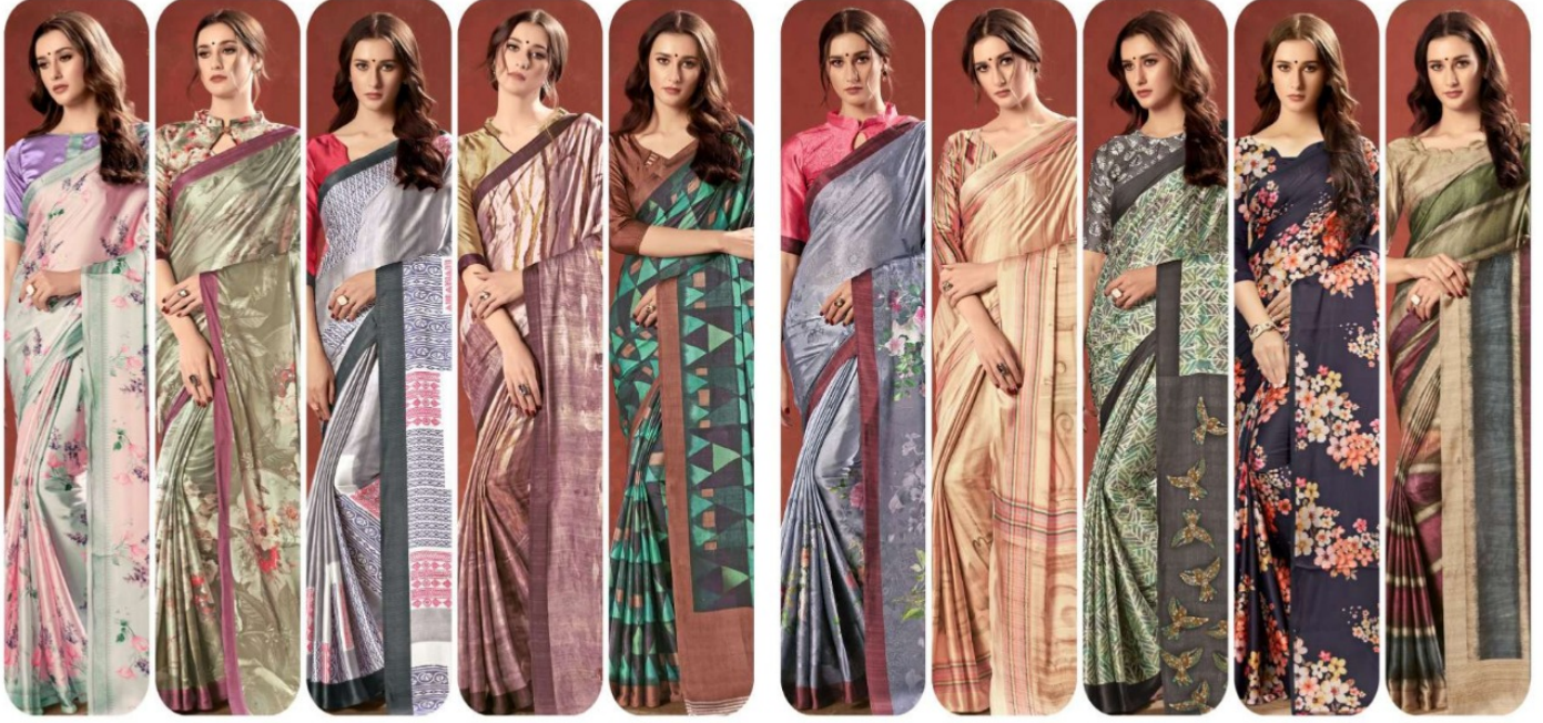
D.NO. 20401 (PRIMIUM CRAP) D.NO. 20402 (PRIMIUM CRAP) D.NO. 20403 (PRIMIUM CRAP) D.NO. 20404 (PRIMIUM CRAP) D.NO. 20405 (PRIMIUM CRAP) D.NO. 20406 (PRIMIUM CRAP) D.NO. 20407 (PRIMIUM CRAP) D.NO. 20408 (PRIMIUM CRAP) D.NO. 20409 (PRIMIUM CRAP) D.NO. 20410 (PRIMIUM CRAP)