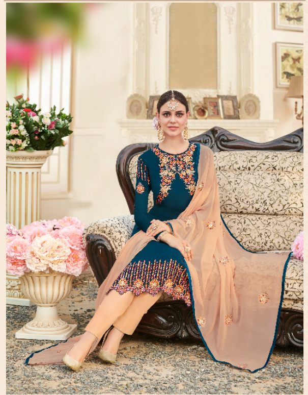
Style No. 9009