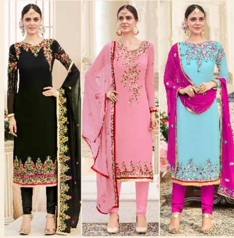
Style No . 9012