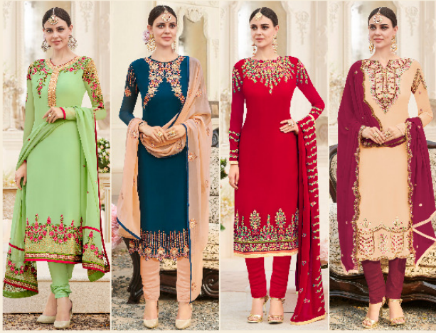
Style No . 9008