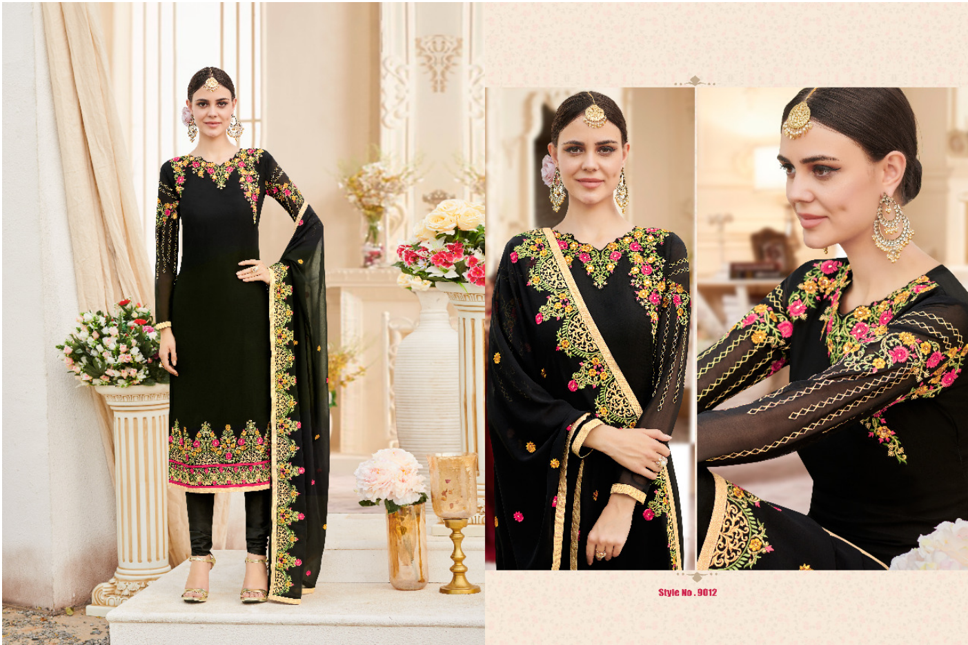
Style No. 9012