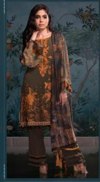
DESIGN NO. 903