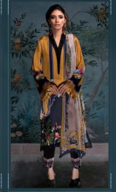
DESIGN NO. 906