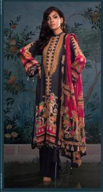
DESIGN NO. 901