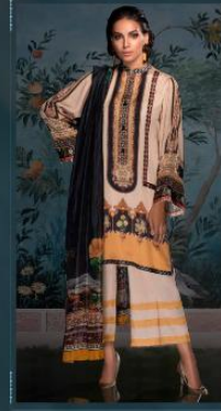
DESIGN NO. 904