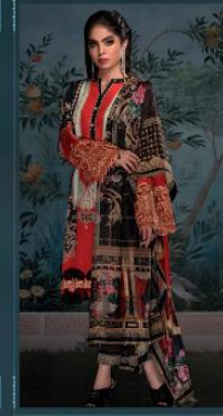
DESIGN NO. 905