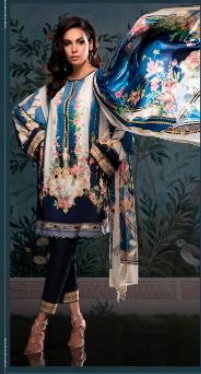
DESIGN NO. 902