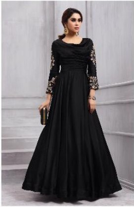
D. NO -153