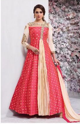
D. NO -151