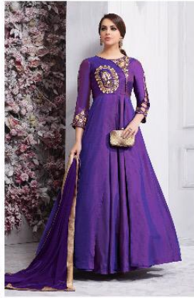
D. NO -158