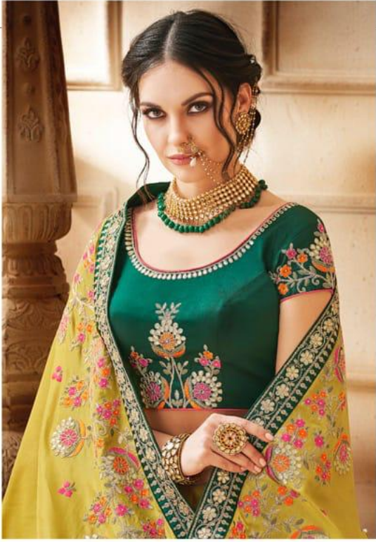
MEHENDI YELLOW HANDLOOM SILK SAREE HAVING GOTA WORK WITH BOTTLE GREEN BORDER AND BLOUSE