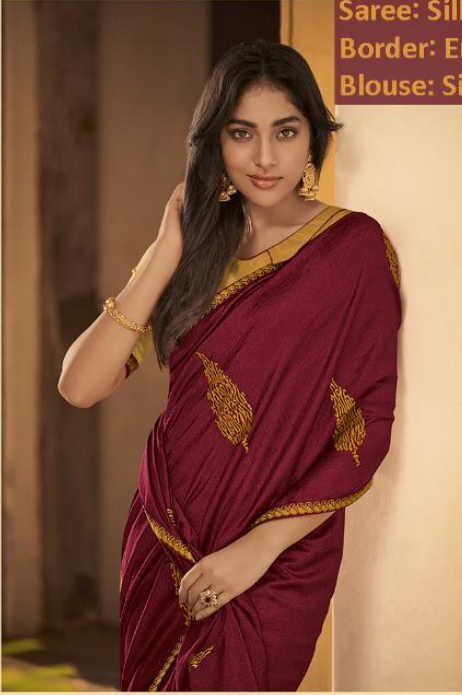
EC-25 | 19387

Design: 19387 Saree: Silk, Embroidery Border: Embroidery Blouse: Silk